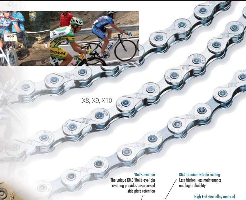
X8, X9, X10

Our X-SP and LongLife treatments effectively enhance durability. Result: longer chain life!